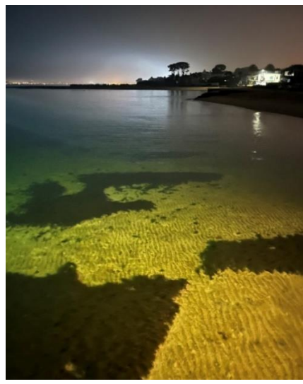
Around the marina...